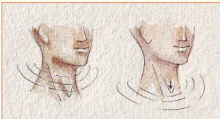
Learning to resist vocal chord displacement.